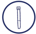
URINE COLLECTION TUBE