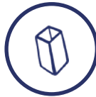
URINE COLLECTION CUP