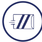
PREPAID RETURN ENVELOPE