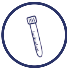
BLOOD SAMPLE COLLECTION TUBES